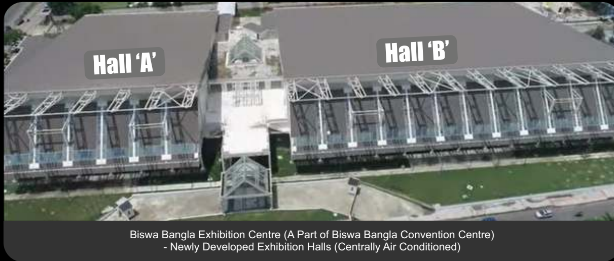
Biswa Bangla Exhibition Centre (A Part of Biswa Bangla Convention Centre) - Newly Developed Exhibition Halls (Centrally Air Conditioned)