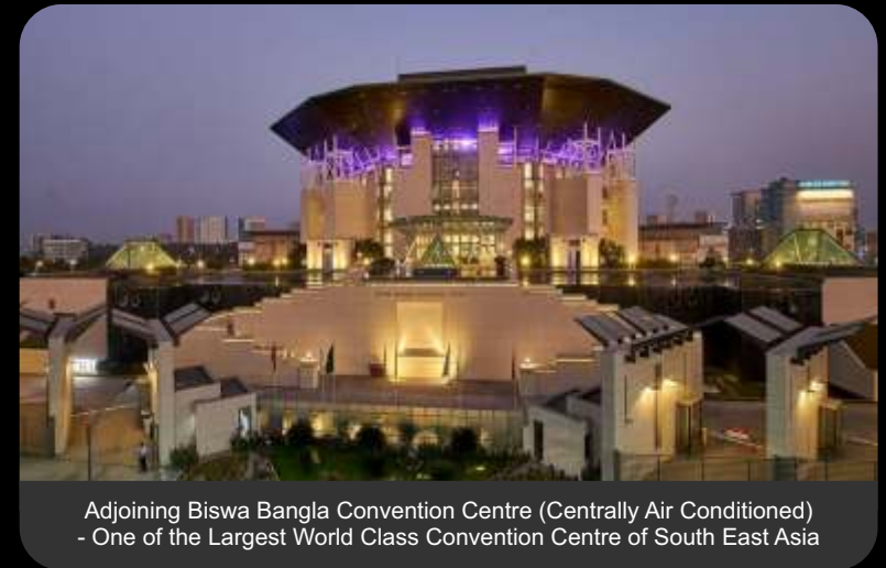
Adjoining Biswa Bangla Convention Centre (Centrally Air Conditioned) - One of the Largest World Class Convention Centre of South East Asia

Biswa Bangla Exhibition & Convention Centre is One of the Largest World Class Convention Centre of South East Asia. It is a ten-storeyed building which houses a Convention Hall, Two Auditoriums, Two Centrally Air-Conditioned World Exhibition Halls & 4 Other Halls of different capacities. There are 822 parking spaces, executive lounges, swimming pool, gymnasiums etc. It also has a Hotel behind the Main Building, with 100 rooms, which is operated on a Public Private Partnership (PPP) basis.